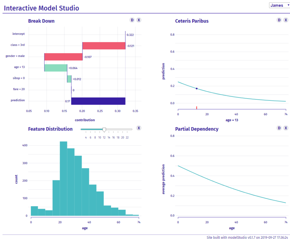
Figure 1: Exemplary HTML output layout.

library("modelStudio") # Create a model model <- glm(survived ~., data = DALEX::titanic_imputed, family = "binomial") # Wrap it into an explainer explainer <- DALEX::explain(model, data = DALEX::titanic_imputed[,-8], y = DALEX::titanic_imputed[,8], label = "glm") # Pick some data points new_observations <- DALEX::titanic_imputed[1:4,] rownames(new_observations) <- c("Lucas", "James", "Thomas", "Nancy") # Make a studio for the model modelStudio(explainer, new_observations)